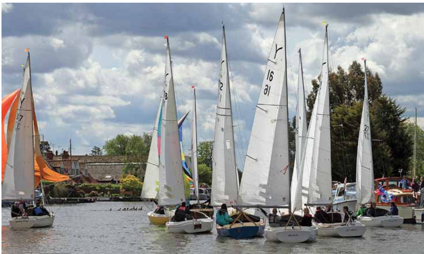
Bunched together down Horning Street