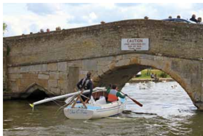
Plenty of room