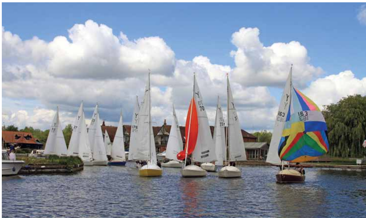
Yeomans away at the start of the 2015 3 Rivers

As usual there was a strong contingent of Yeomans in the 2015 Three Rivers Race. This year 86 boats completed the course, with the top spot going to the River Cruiser, Beth (Sail no. 82) with a corrected time of 11:05:12. All the Yeomans that entered completed the course. The results were as follows: