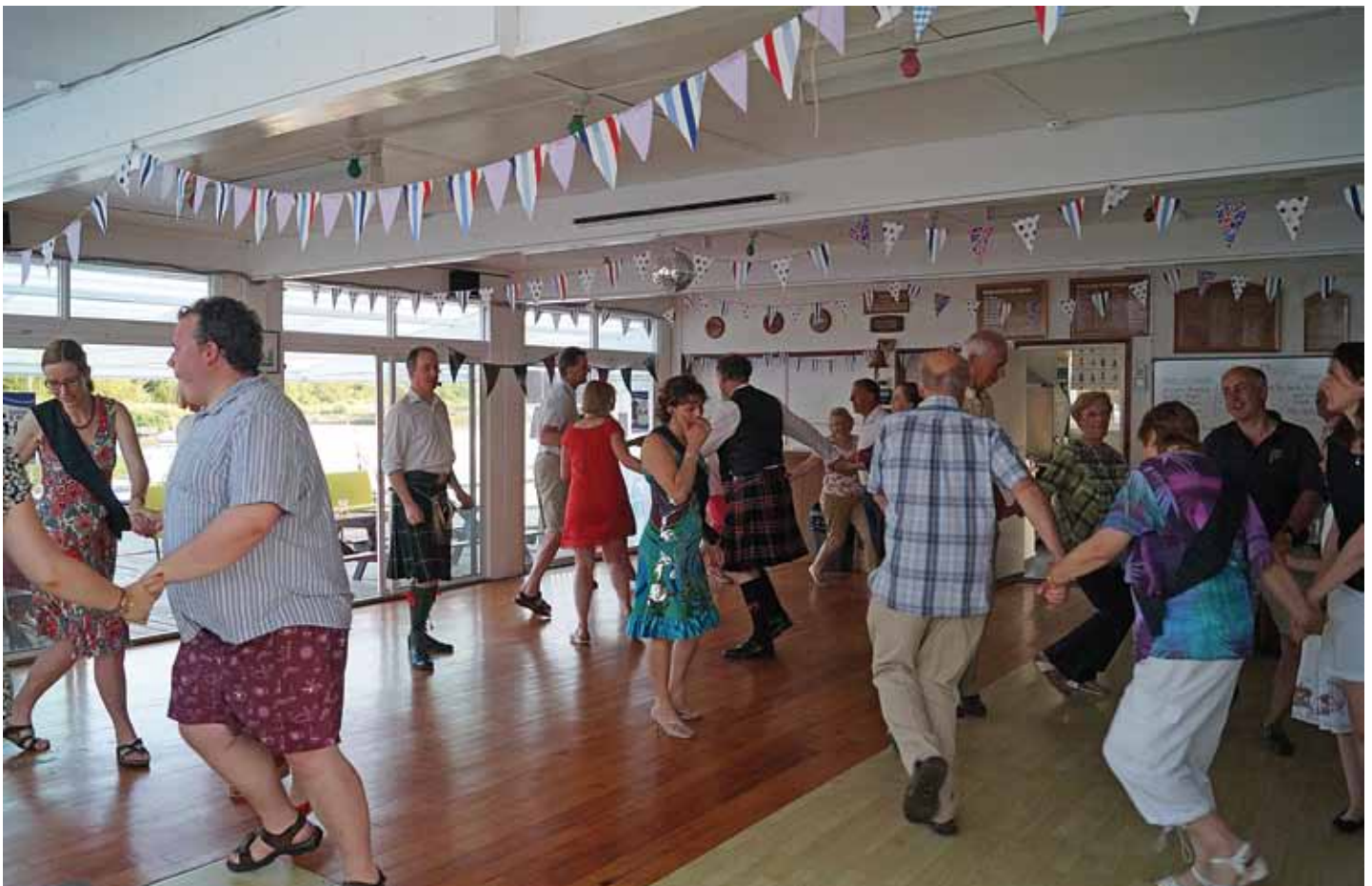
The clubhouse was cleared to make way for the revellers, July 2015

(With a name like that it's no wonder I enjoyed the dancing!)