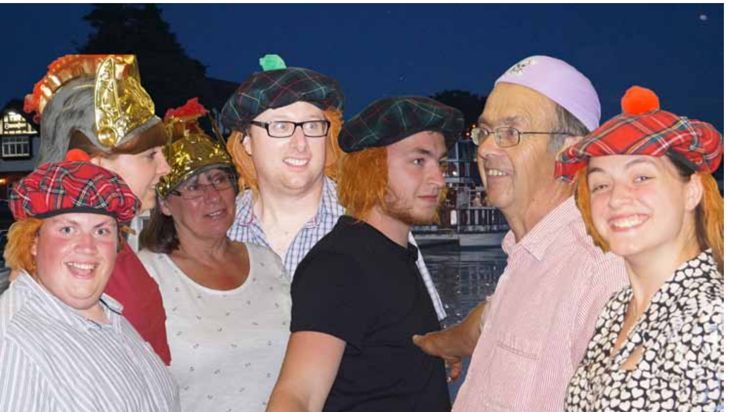
Snowflakes take safety very seriously and have trialled a variety of new safety caps which may be compulsory next year!