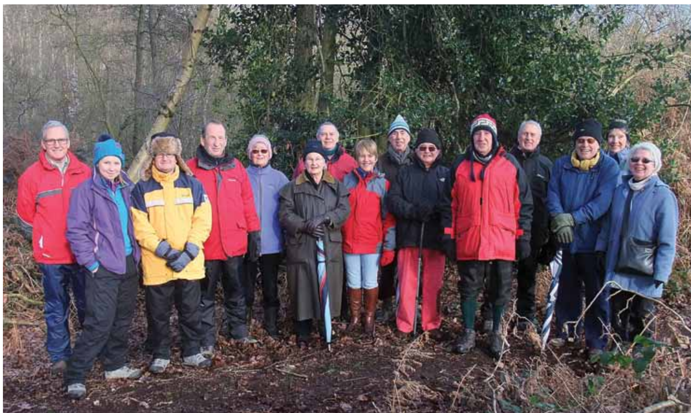
A hardy crew well kitted out took to the woods for the annual NBYC winter walk starting this year from Horning

The fleet has had an enjoyable start to the season.