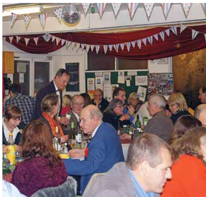
All's well that ends well. A great Burns night enjoyed by all