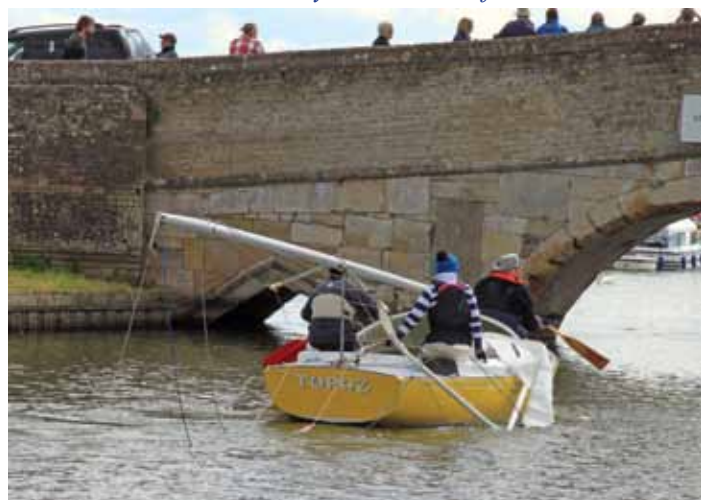
A paddle comes in useful at times