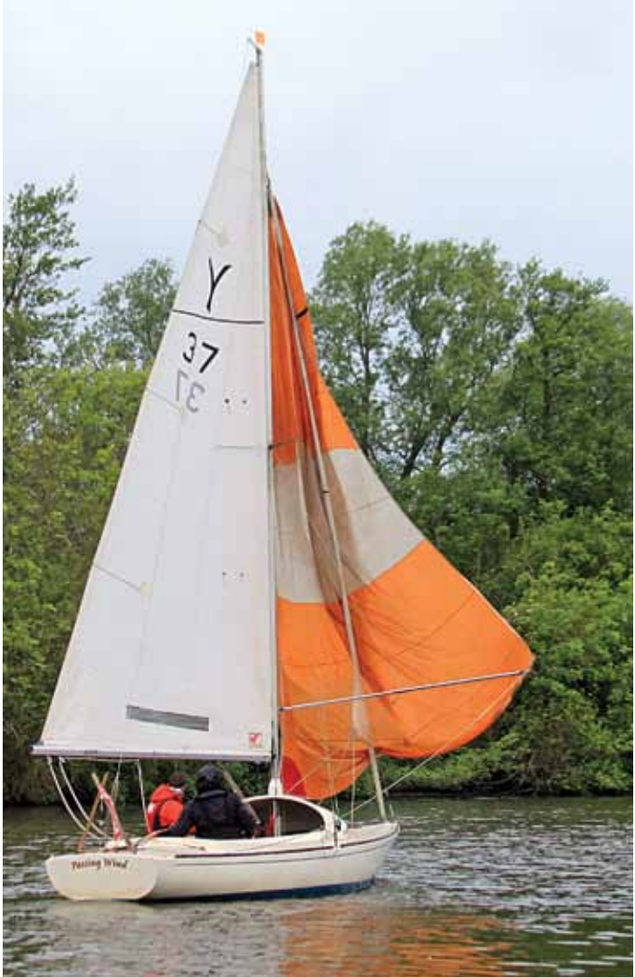
Where has the wind gone?