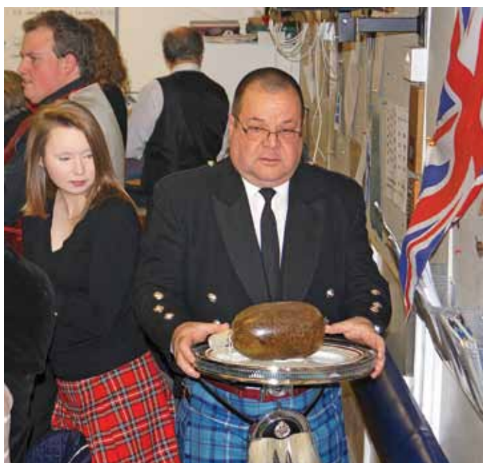
Bomb squad nervously removes the suspicious object