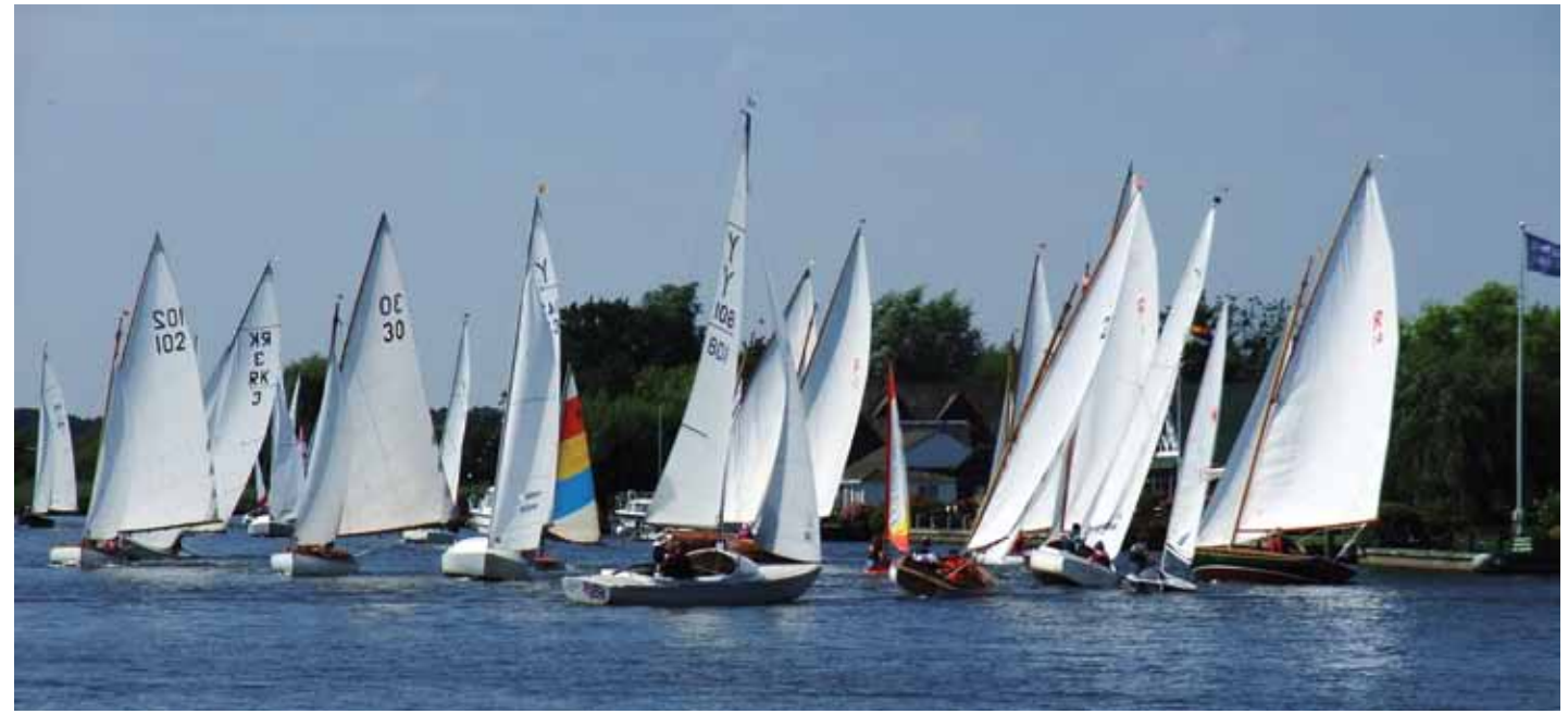
Yeomans well in the mix on the sunny Monday of Horning week

There was a good turn out of Yeoman sailors at the Horning Week Regatta this year which, as normal, was held during the first week of August. A total of 11 boats participated over the seven days sailing for three Yeoman series trophies and a number of one off Allcomers' races. We were lucky with the weather in general this year with the exception of Thursday when it rained pretty much all day. The wind on Wednesday decided it was having a holiday as well but these conditions suited some sailors.