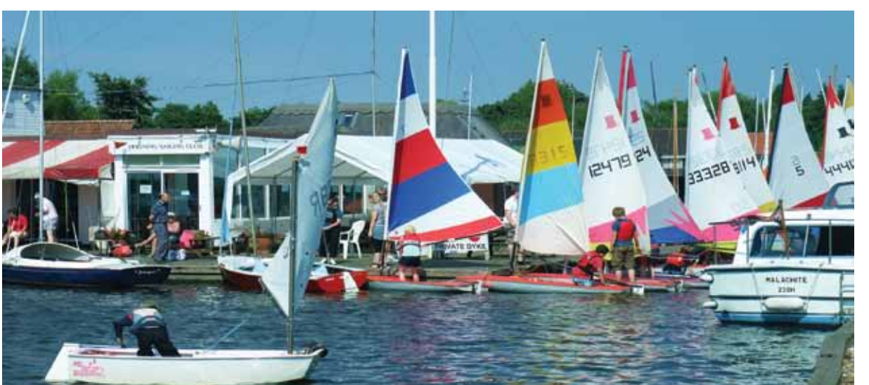
Only one Yeoman but the Toppers make a colourful scene at Horning