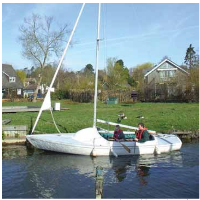
Toby Fields in Y9, Tanksey