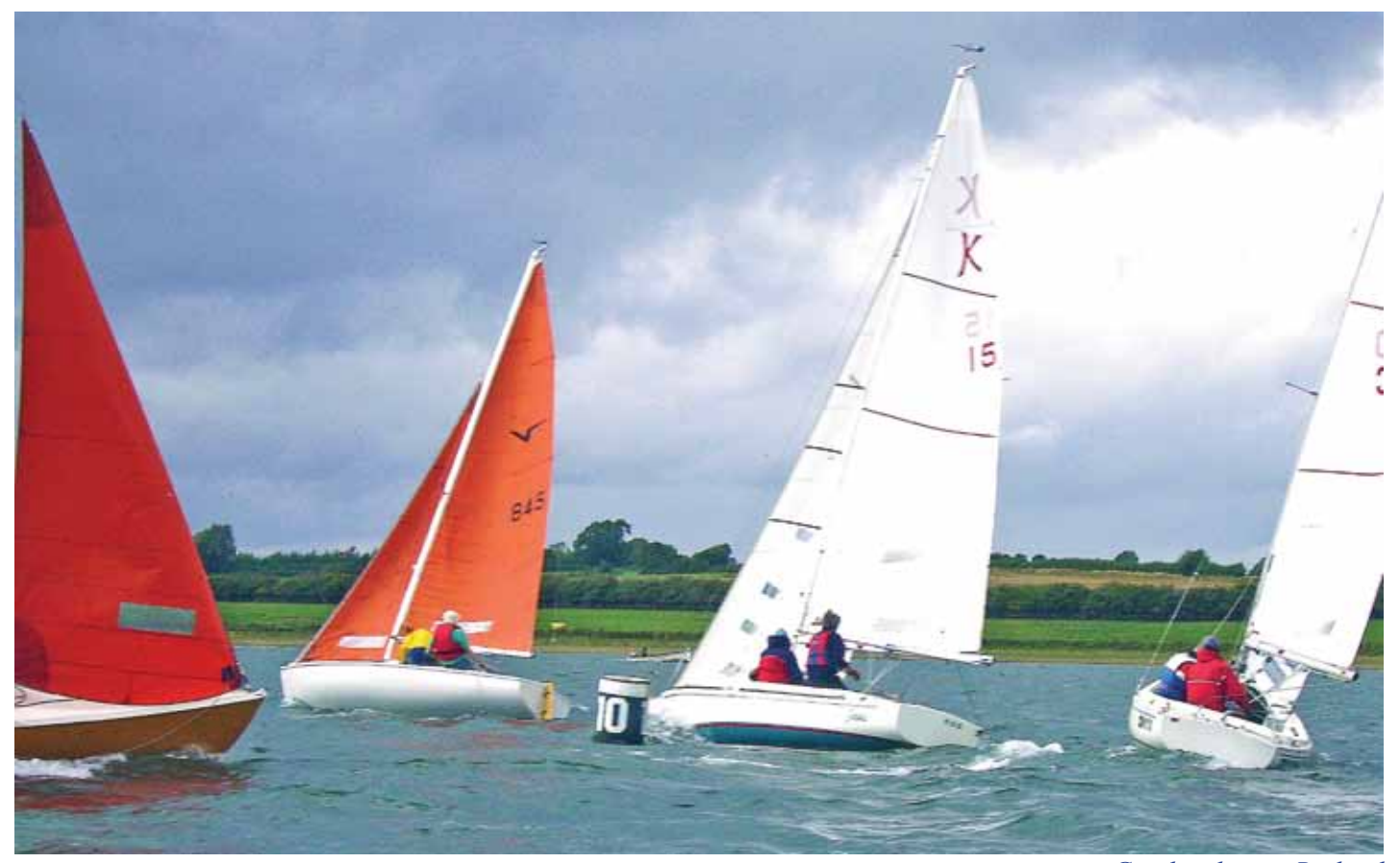
Good sailing at Rutland

I am pleased to report another very successful season for the Rutland fleet of Yeoman and Kinsman yachts. The fleet now comprises two Yeoman and eight Kinsman.