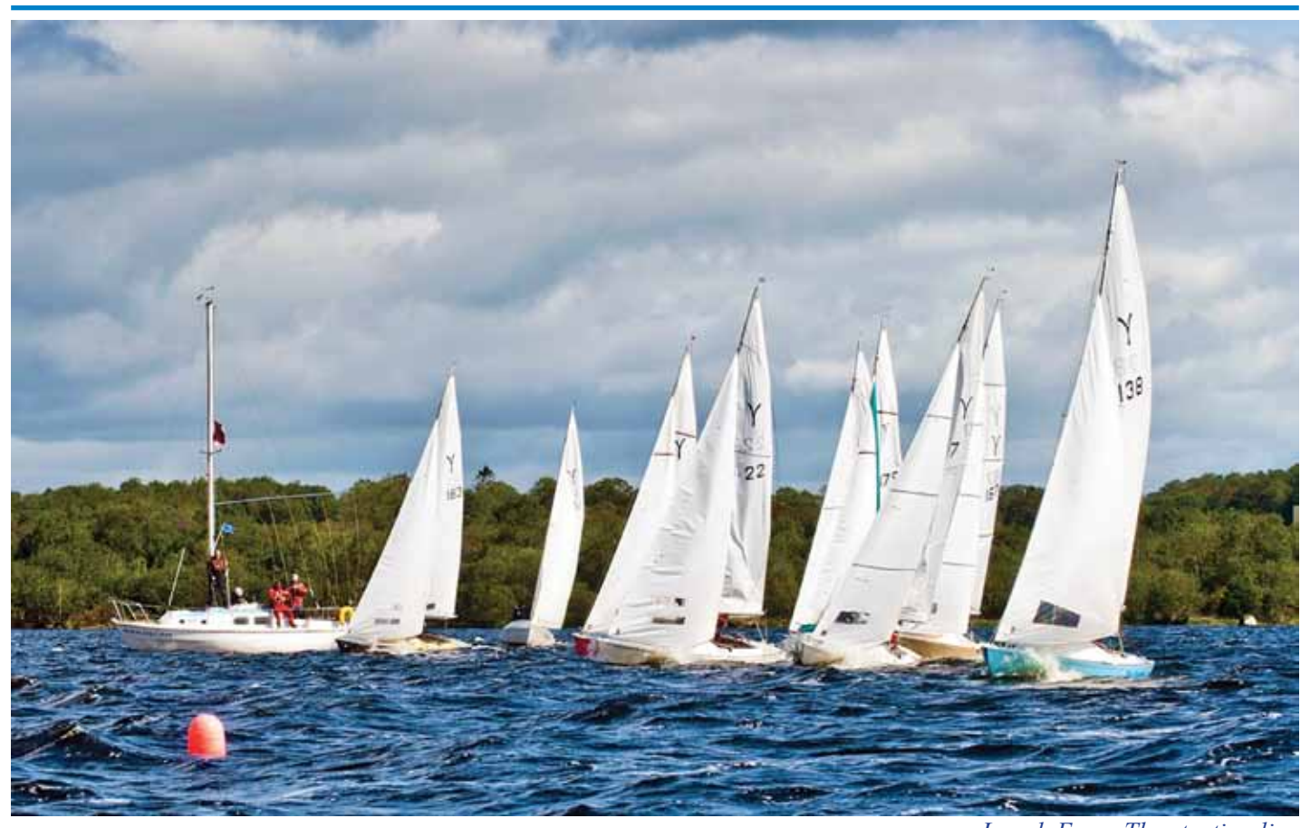
Lough Erne: The starting line