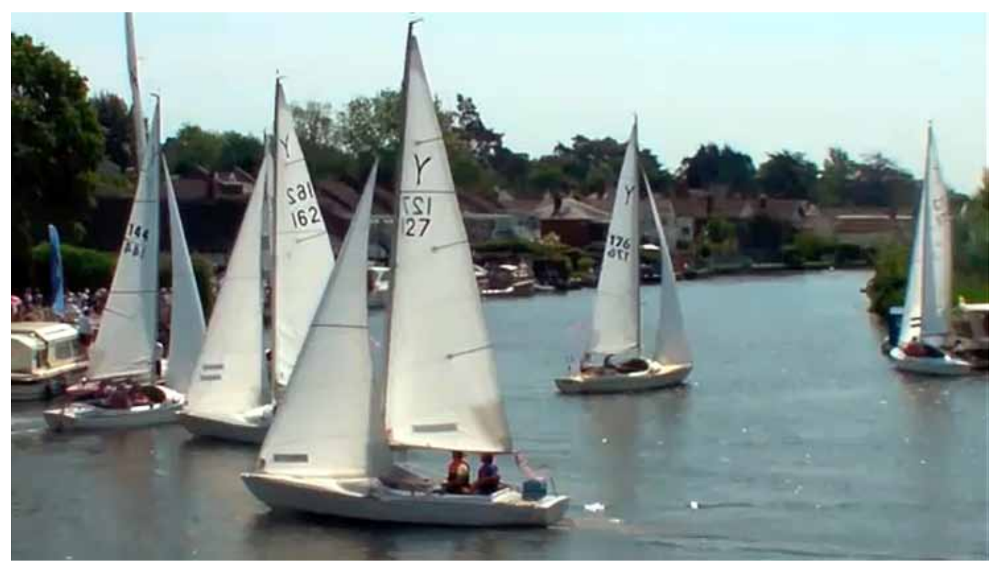
Yeomans rounding the bend at Horning at the start of the 'Three Rivers' Race"

The first point I need to make about this year's race is about the wind. As many of you may know it was 15+ reaching force 5 with small white tops on the longer fetches of water in clear air. The second is about our crew. Not only did our joint ages total 208 years (before you get out the record books there were three of us) but also one of the crew had only sailed in a Yeoman once before a couple of weeks previously. Ominously during this outing we had broken the skeg and rudder on a hard underwater object. (Thanks to Phil Betts, class builder, for the quick repairs.)