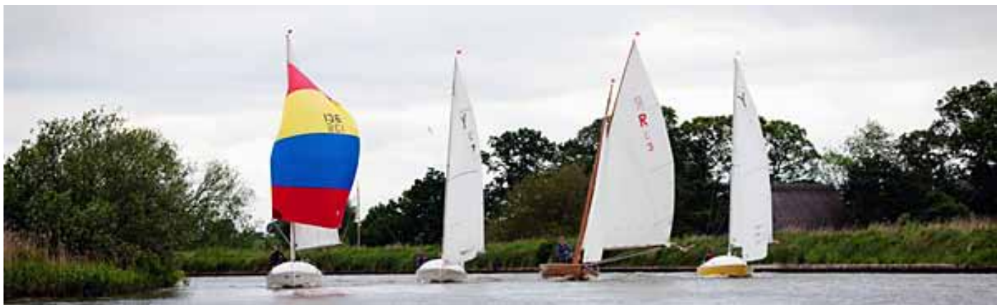
Yeomans in formation

Horning Sailing Club hosted its 52nd Three Rivers' Race over the weekend of the 9th-10th June 2012 in somewhat difficult circumstances. With strong winds blowing throughout Friday, overnight and into Saturday morning, the fate of the Race taking place looked questionable as heavy gusts blew through the morning.