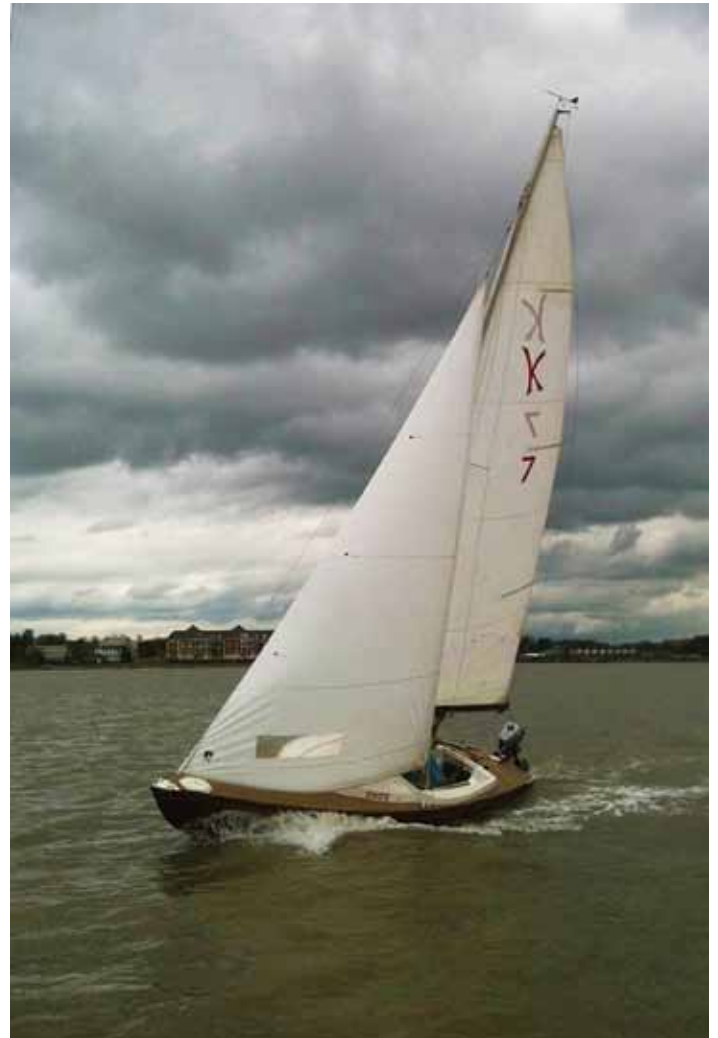
Beating up in a bit of a blow early in the year