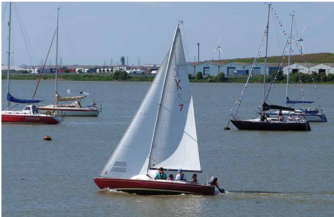
K7 on the Thames ,close to Erith Yacht club