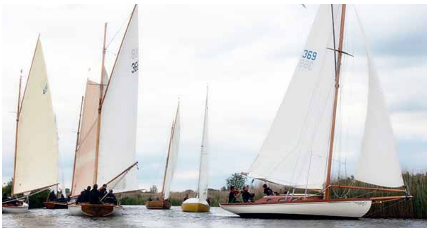
Topaz, Y4, faces some heavy competition