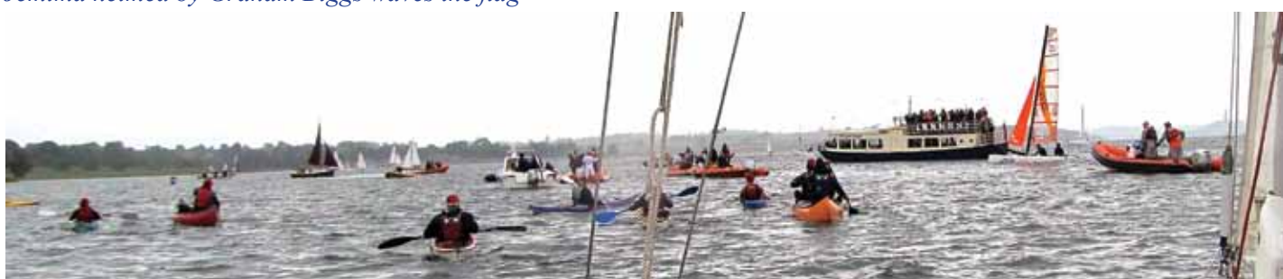
Plenty of support for the torch bearers