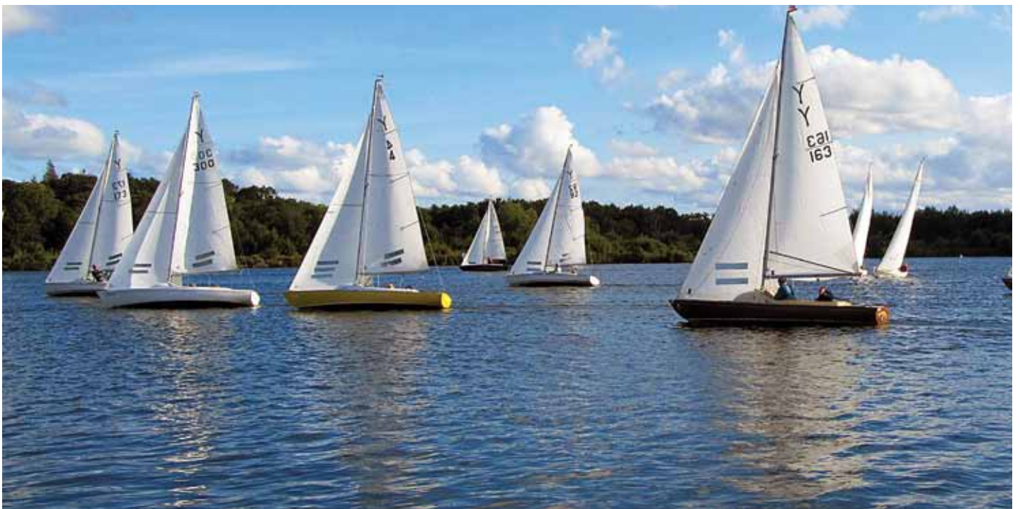
'Reflecting' on the best course