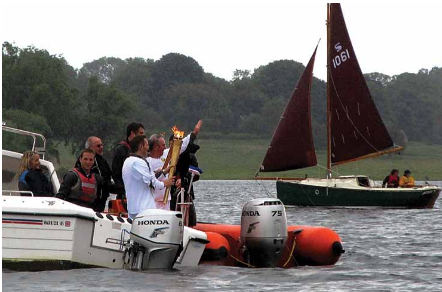
The torch is safely passed